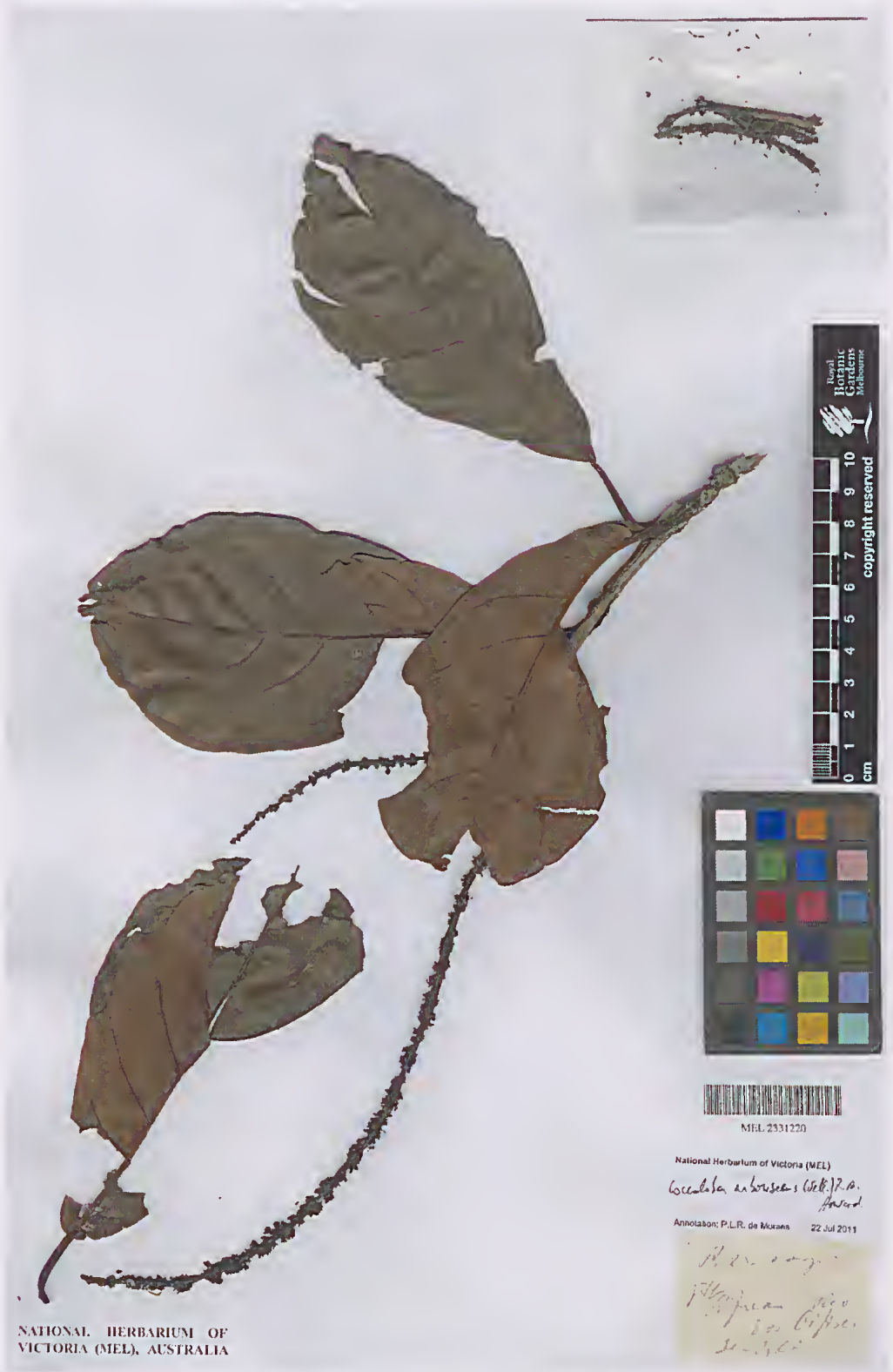
Figure 3. MEL 2331220 – Cocoloba arborescens (Vell.) R.A.Howard (Polygonaceae). [Rio de Janeiro: between] St. Juan [= San João] – Rio dos Oistres [= Rio dos Ostras, M.A.P.zu Wied s.n., Sep 1815]. See fig. 8c for label detail and transcription.